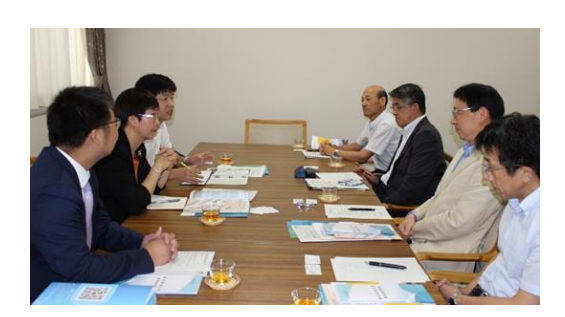
Meeting on the occasion of the courtesy visit.

The Dean of Northeast Forestry University (NEFU) School of International Education and Exchanges (China) made a courtesy visit to our graduate school and exchanged views with our Dean and Vice Deans about educational and research exchanges of professors, researchers, and students in the future (Sep 20, 2019).